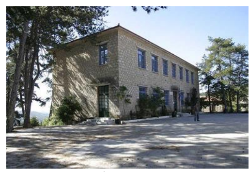
Karyes' Primary school