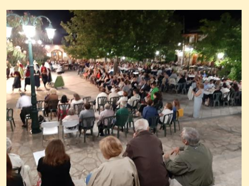
The Karyates Worldwide Association aims to have the event recurring annualy, thus providing all Karyates with the opportunity to showcase their works. Please feel free to contact